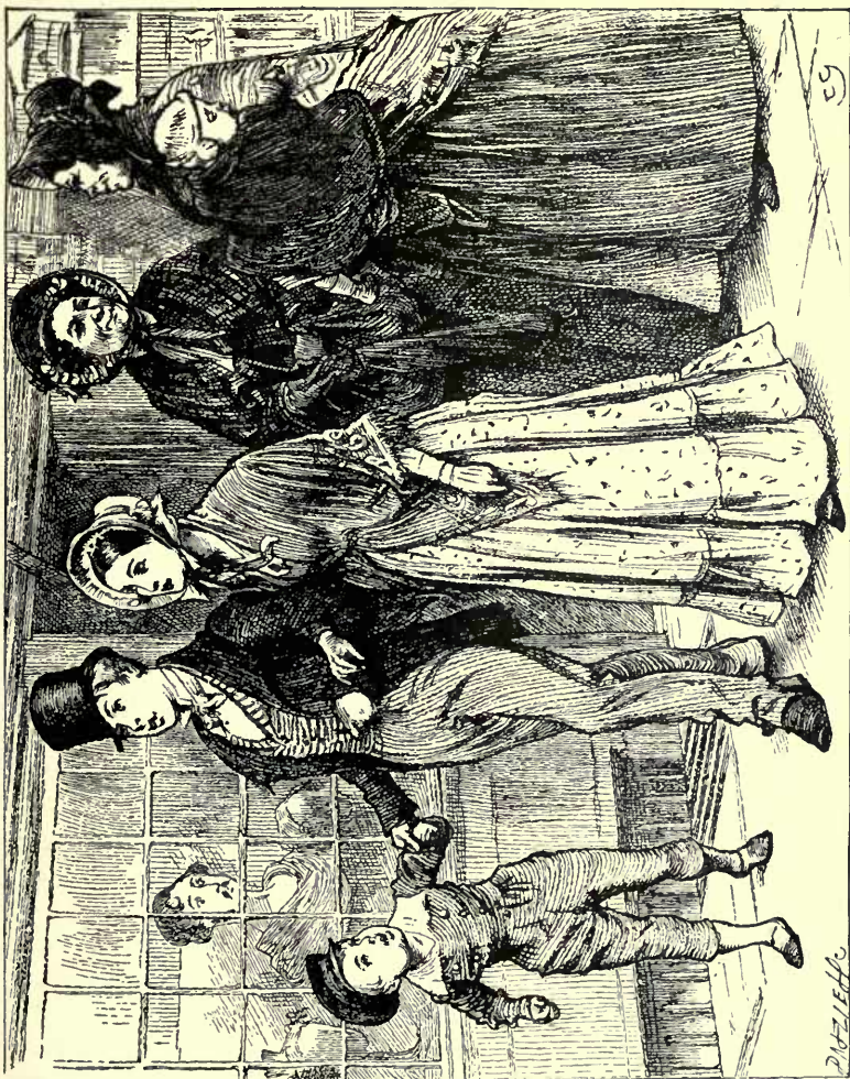
AT LENGTH EVERYTHING WAS READY AND THEY WENT OFF.